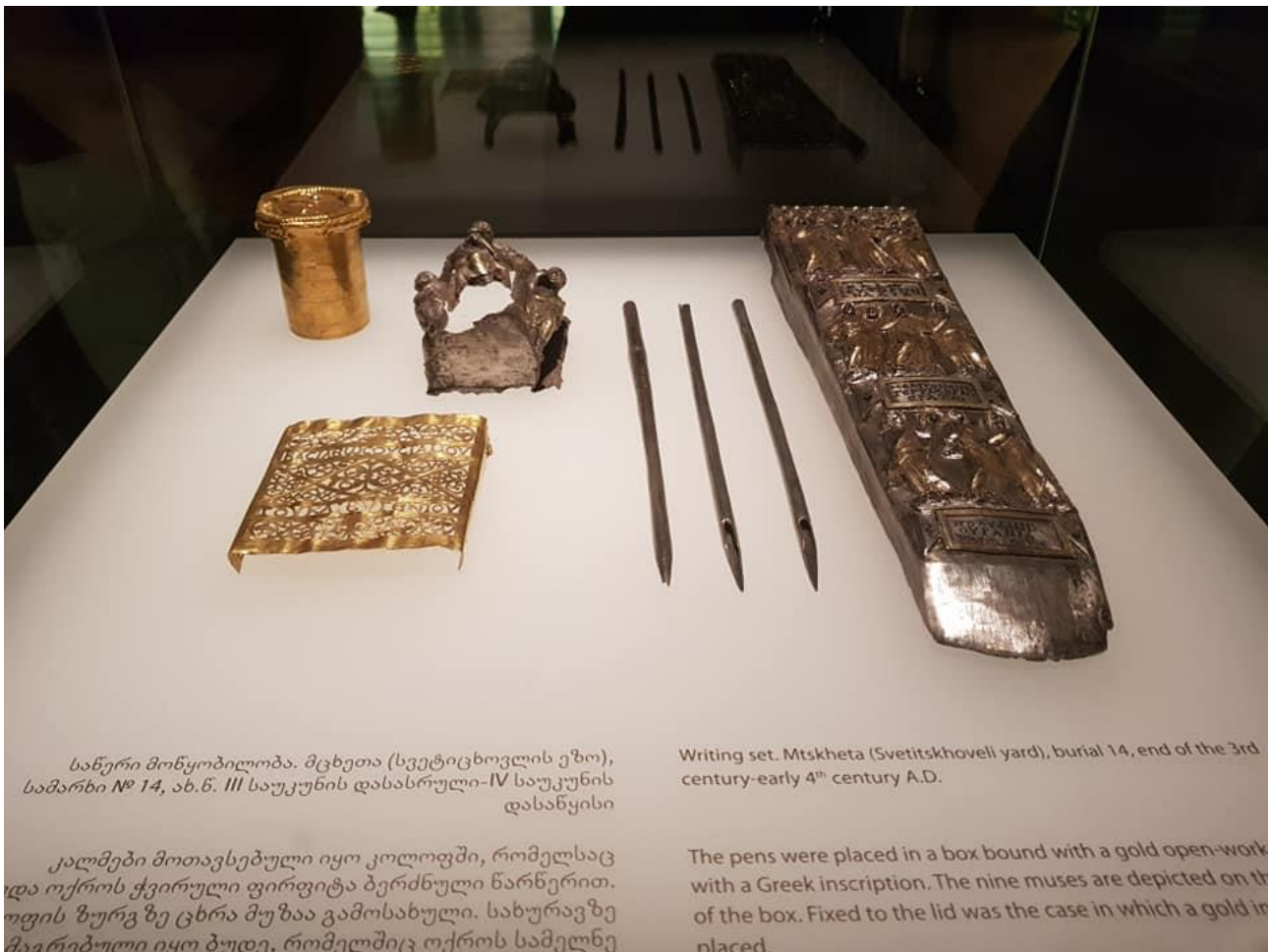
საწერი მონოტილობა. მცხეთა (სვეტიცხოვლის ეზო), სამარხი № 14, ახ.წ. III საუკუნის დასასრული-IV საუკუნის დასაწყისი